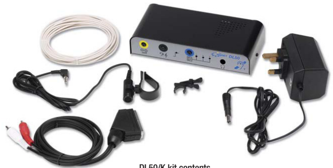
DL50/K kit contents