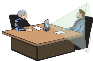
Typical meeting room application

Simplicity itself : the rear of the amplifier includes short form user instructions detailing how the system works